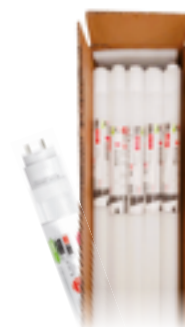
FVT8M - Industrial Pack

Confezione industriale da 25 pz con foam protettivo Industrial pack of 25 pcs with protective foam